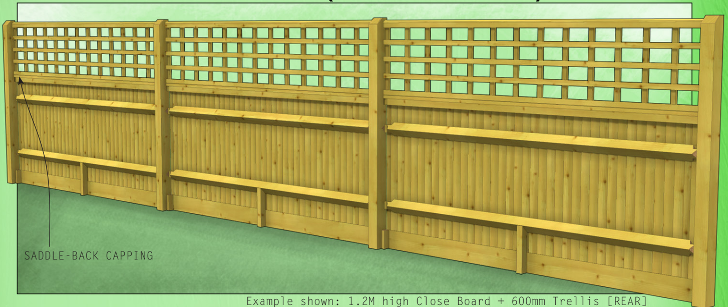
Example shown: 1.2M high Close Board + 600mm Trellis [REAR]